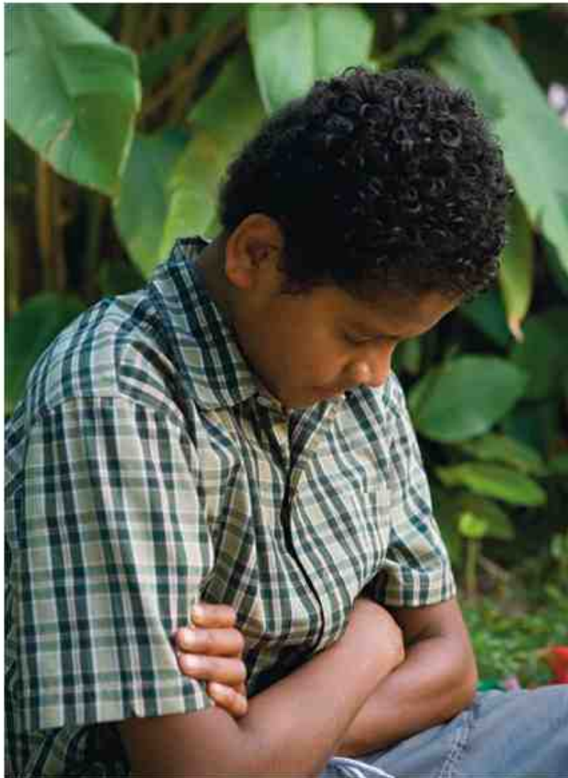
Young Boy Praying, photo © 2006 IRI